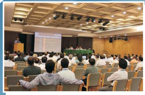
CORRUPTION PERCEPTIONS INDEX 2014: RESULTS